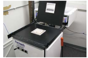
Figure 1: Place the PPSF part (center) and load a PEEK sheet (top; clear pane) in the vacuum forming machine.

Following the vacuum forming operation, trim the PEEK sheet to the size of the PPSF part. The PPSF/PEEK part (figure 3) is now ready to be put into service.