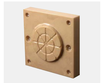
Figure 3: The PEEK sheet conforms to the part's shape while smoothing its surface